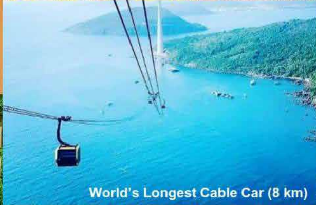
World's Longest Cable Car (8 km)