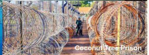
Coconut Tree Prison