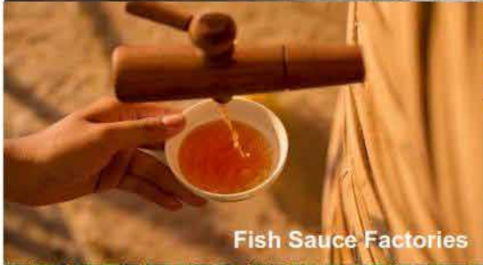
Fish Sauce Factories