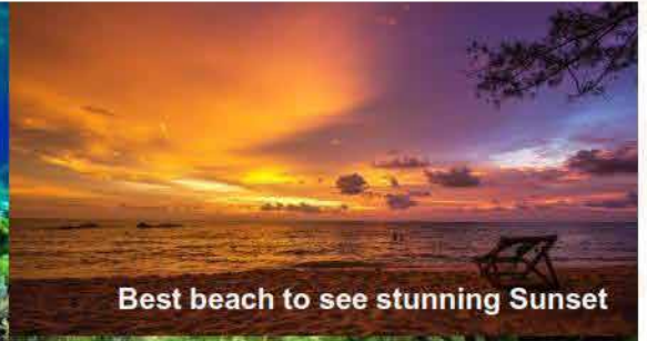
Best beach to see stunning Sunset